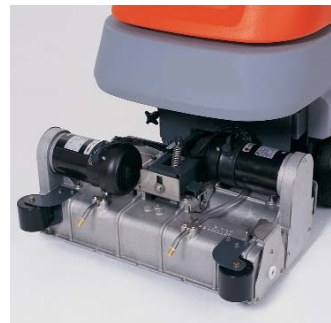
Phoenix 26 and 30