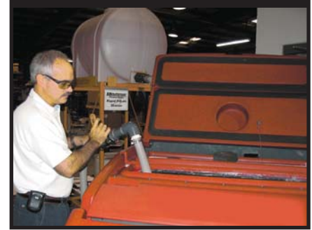
Optional Rapid Fill Station available, helps refill solution quickly