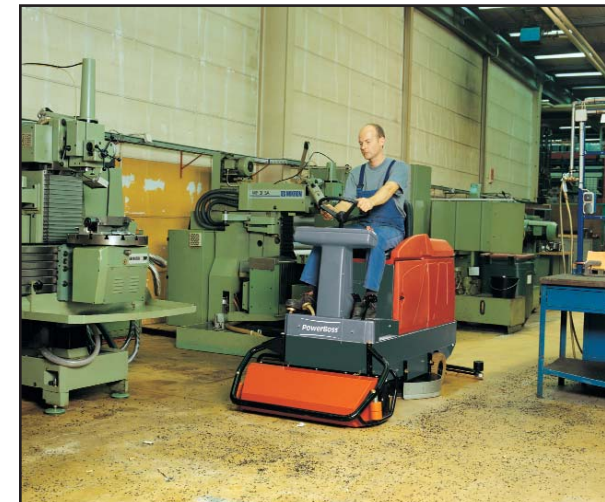
Admiral 36: For perfect maintenance or basic cleaning. Highly maneuverable, compact, easy, light handling, powerful and efficient.