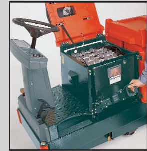
Batteries: Battery system easy to access with quick exchange device (optional equipment).