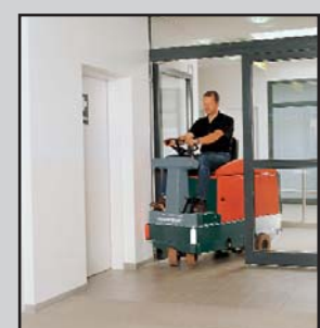
Compact and maneuverable: Fits through any standard door. Minimum passing width of 27in.