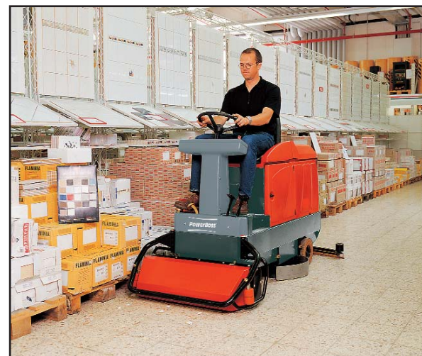
With pre-sweep and tool: Pre-sweeping and scrubbing in one operation, additional scrubbing and vacuuming tool for edges and corners.