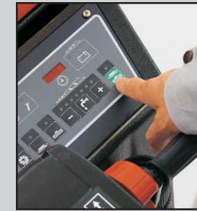
Operating panel: All cleaning functions can be started simultaneously. Quick and easy.