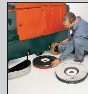
Brushes: Brushes and pads can be changed in a flash without the use of tools.