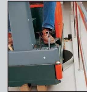
Working close to the edge: Poses no problem with protruding brushes and suspended squeegee.