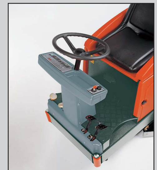
Operator compartment: The operator can access the driver's seat from both sides with an excellent view of the area to be cleaned. All operating elements are in direct view and easy reach of the operator. Adjustable, comfortable driver's seat.